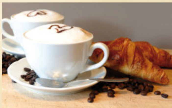
Unser Frühstücksraum. | Our breakfast room.